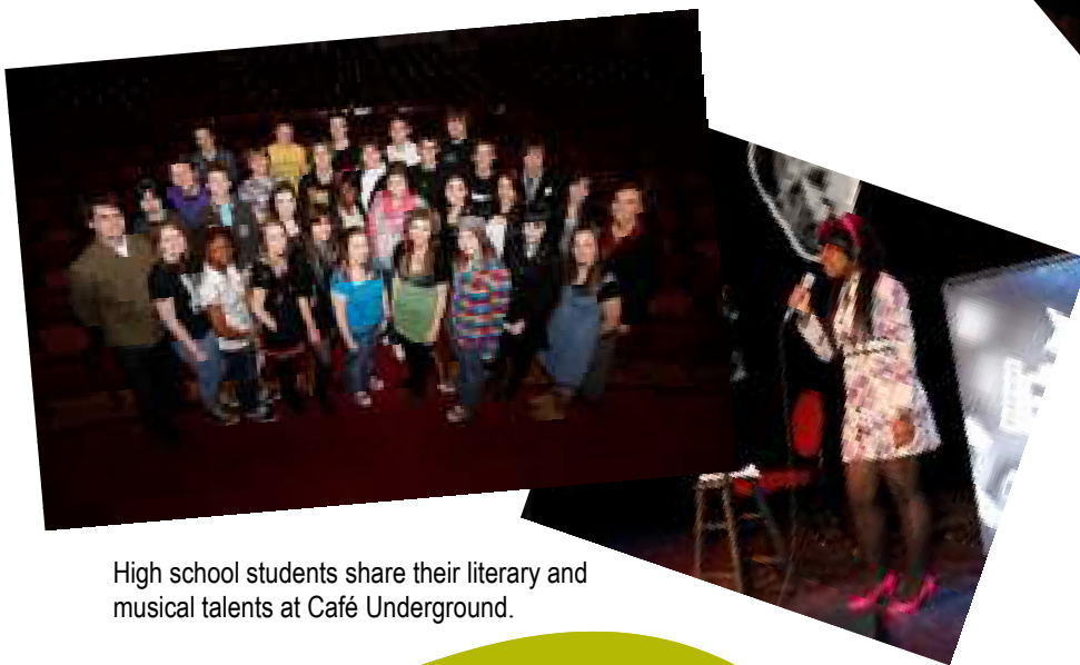
High school students share their literary and musical talents at Café Underground.