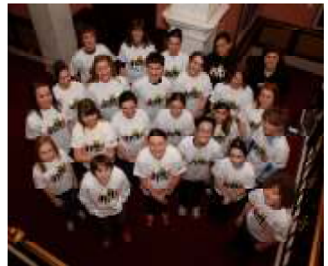
Our Budding Writers pose nervously before presenting their work to the public.