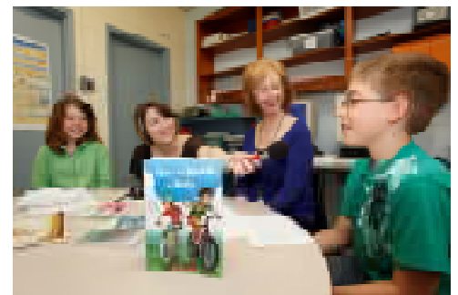
The School-Youth Program encourages children to discover the fun of reading ... and to share it publicly!