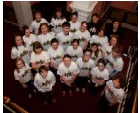
Our Budding Writers pose nervously before presenting their work to the public.