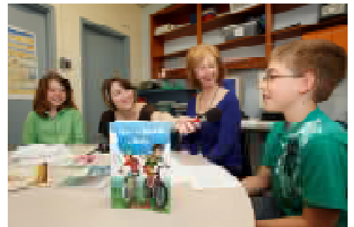
The School-Youth Program encourages children to discover the fun of reading ... and to share it publicly!